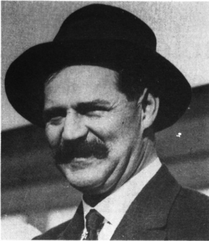
Louis Chevrolet

Louis Chevrolet was born in 1878 in Switzerland and his brother Arthur was born in 1886 in France. They came to America in the early 1900's, and both enjoyed early success behind the wheel of a racing car.